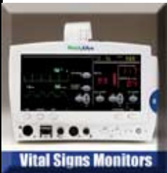
Vital Signs Monitors

Abbott AVI B. Braun Baxter Imed Ivac Sabratek Sigma MedFusion MTP