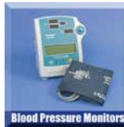
Blood Pressure Monitors

Philips/HP Spacelabs Datascope GE Critikon Propaq MDE Criticare Welch Allyn