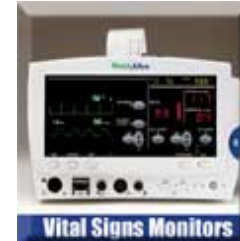
Vital Signs Monitors

Toco and Ultrasound Transducers: HP / Philips Spacelabs Corometrics