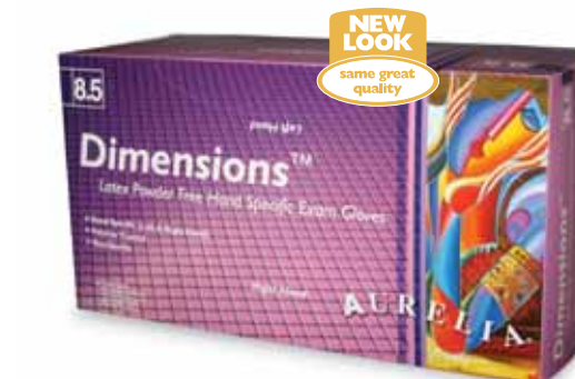
Hand-Specific Comfort Superb Ergonomics