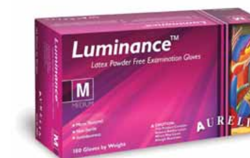
Optimum Comfort Fully Textured