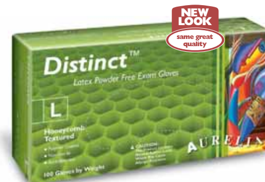
Unique Honeycomb Texture Superior Tactility