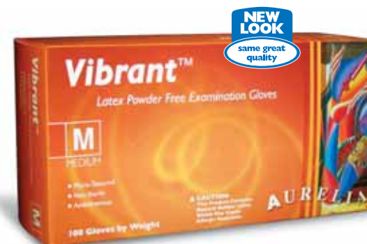
Textured Grip Maximum Value