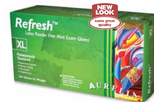
Mint Scented Exclusive Honeycomb Texture